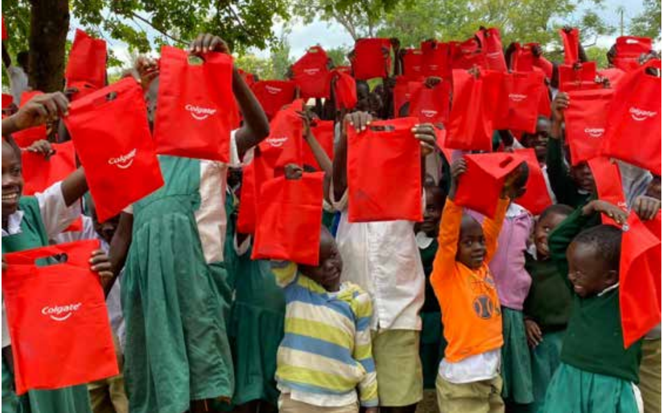
KIDS WITH NEW TOOTHBRUSHES AND TOOTHPASTE