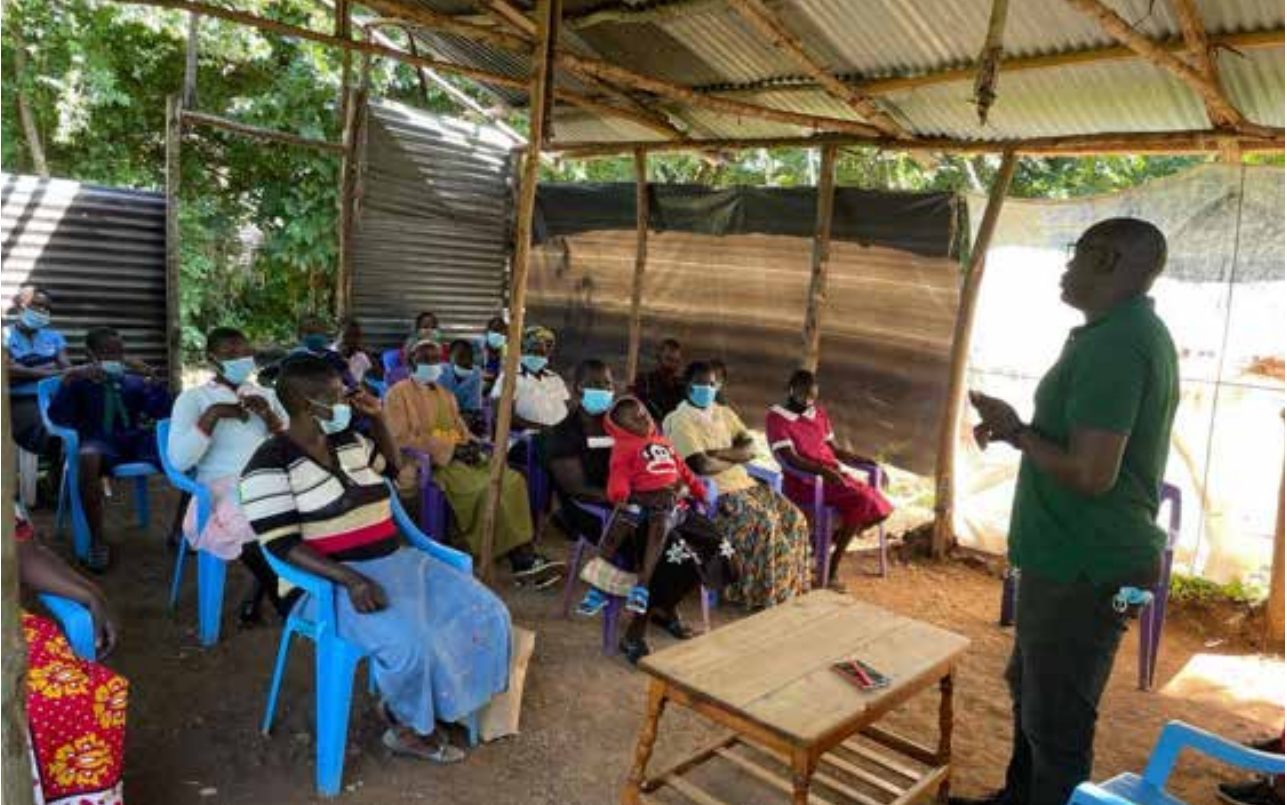
MEETING SOME POTENTIAL SPONSORED CHILDREN AND THEIR PARENTS