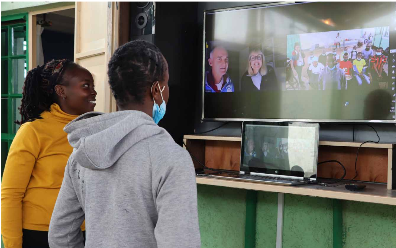
MENTORSHIP VIA ZOOM