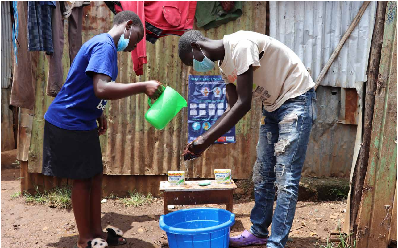
HANDWASHING AT HOME