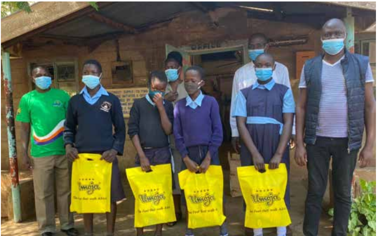
VISITING SOME SPONSORED CHILDREN AT SCHOOL AND HANDING THEM BRAND NEW SCHOOL SHOES