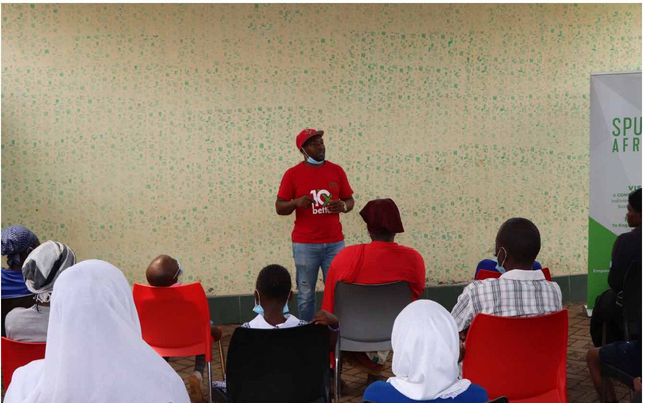
NEW PARENTS MEETING