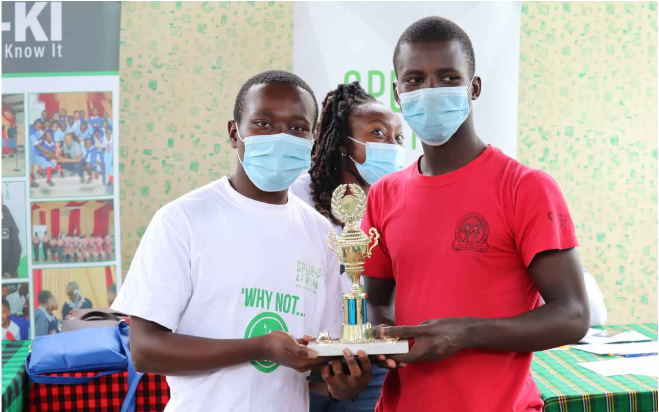
RIKI COMPETITION AT CENTRE