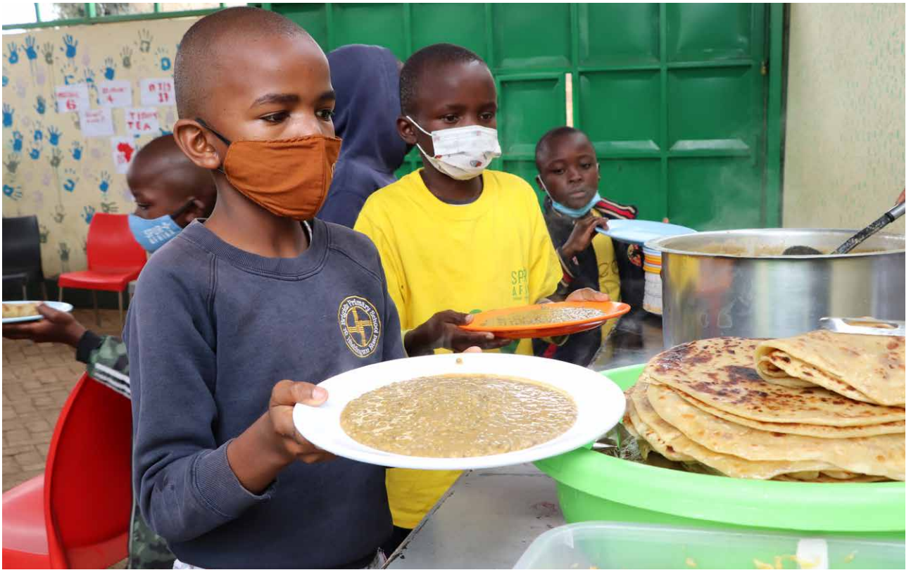
HOT LUNCH AT SPUR CENTRE