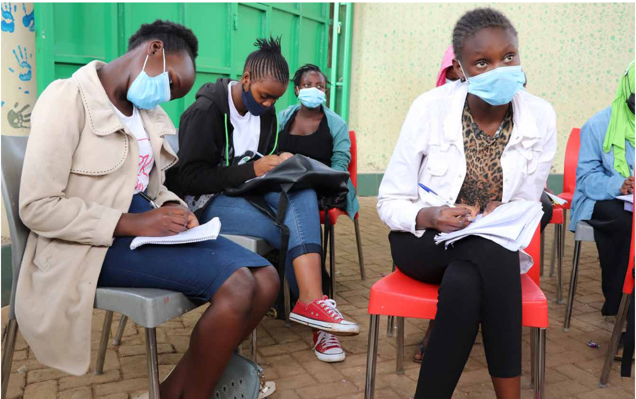
BINGWA GIRLS PROGRAM