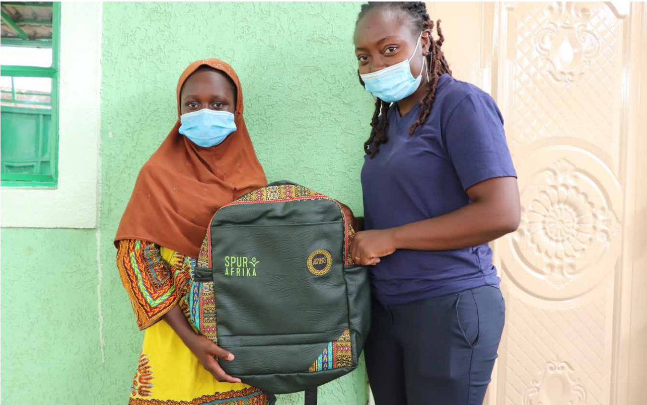
NEW SCHOOL BAGS