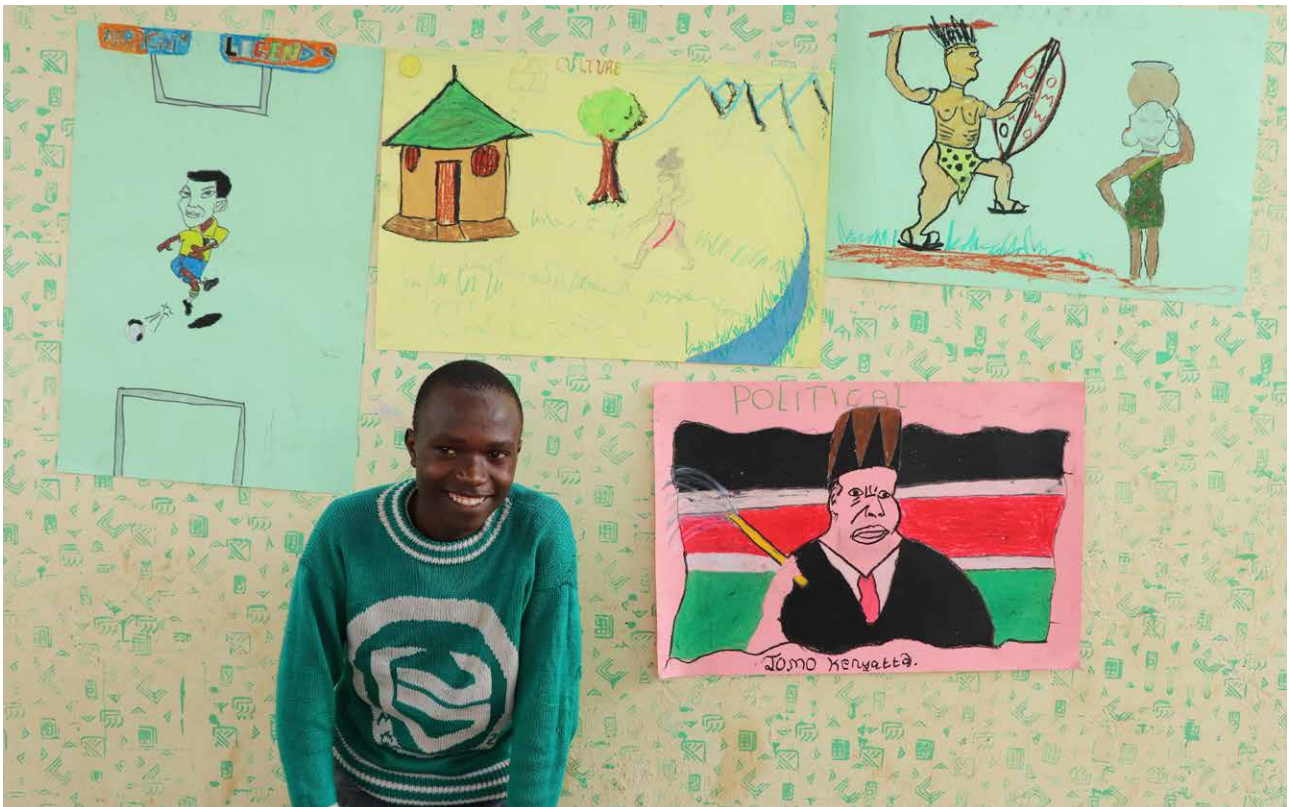
DAY OF THE AFRICAN CHILD SESSION