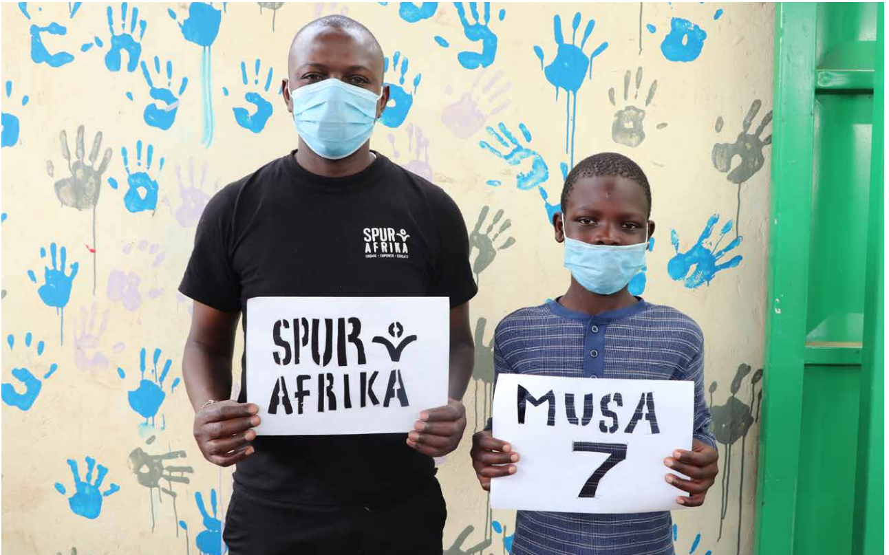
ART CLASSES AT SPUR CENTRE