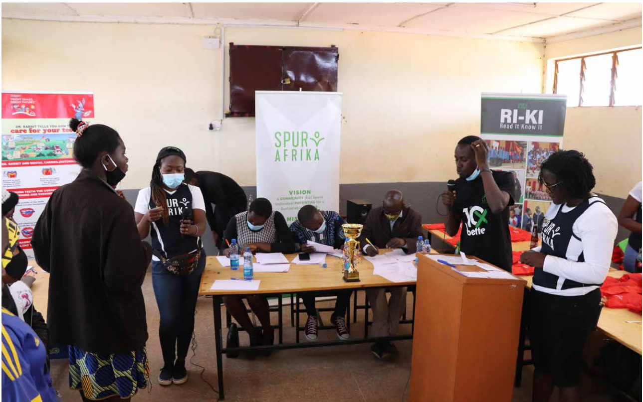
RIKI COMPETITION AT SCHOOLS