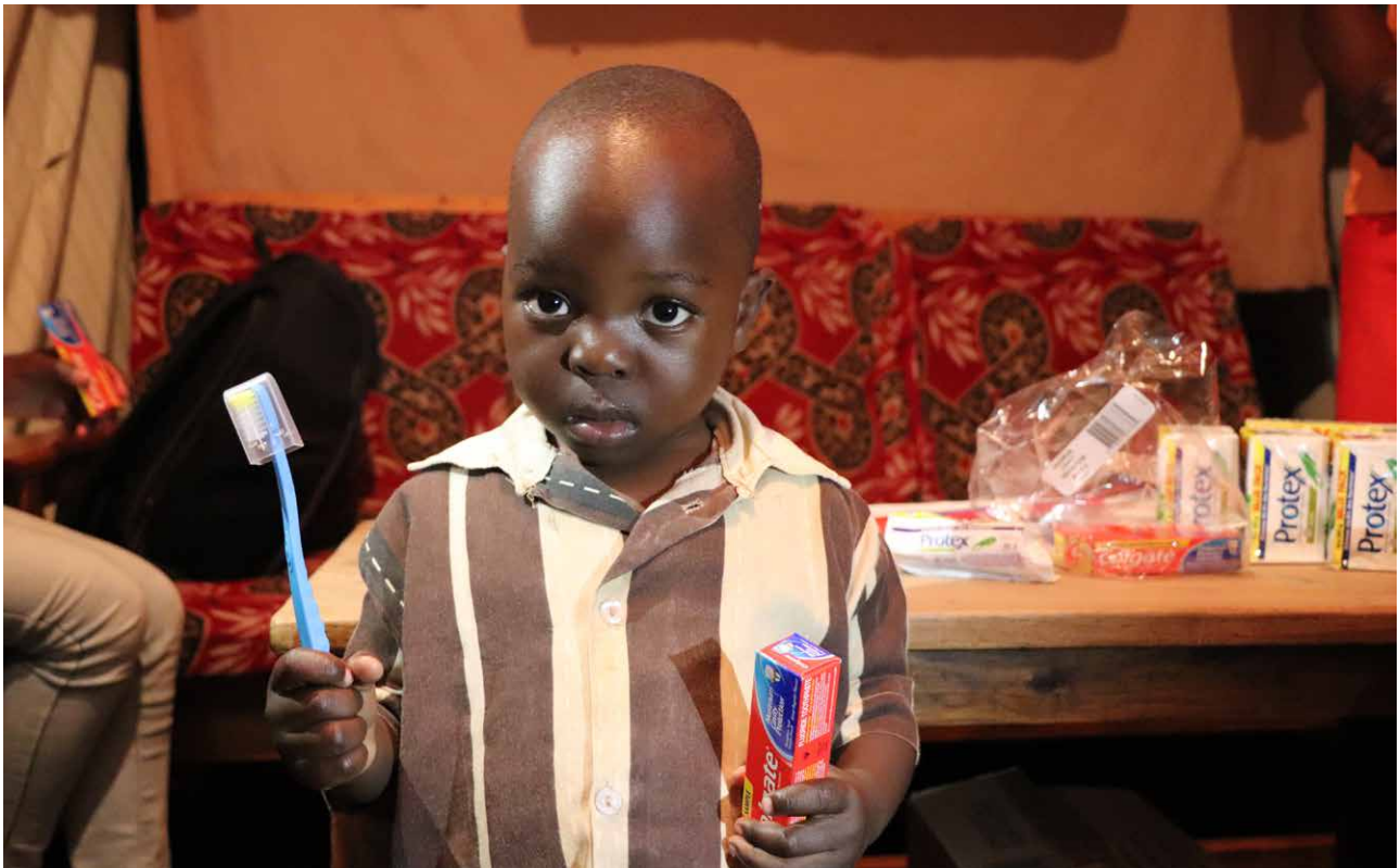
GIVING OUT SOAP AND TOOTHBRUSHES AT HOMES