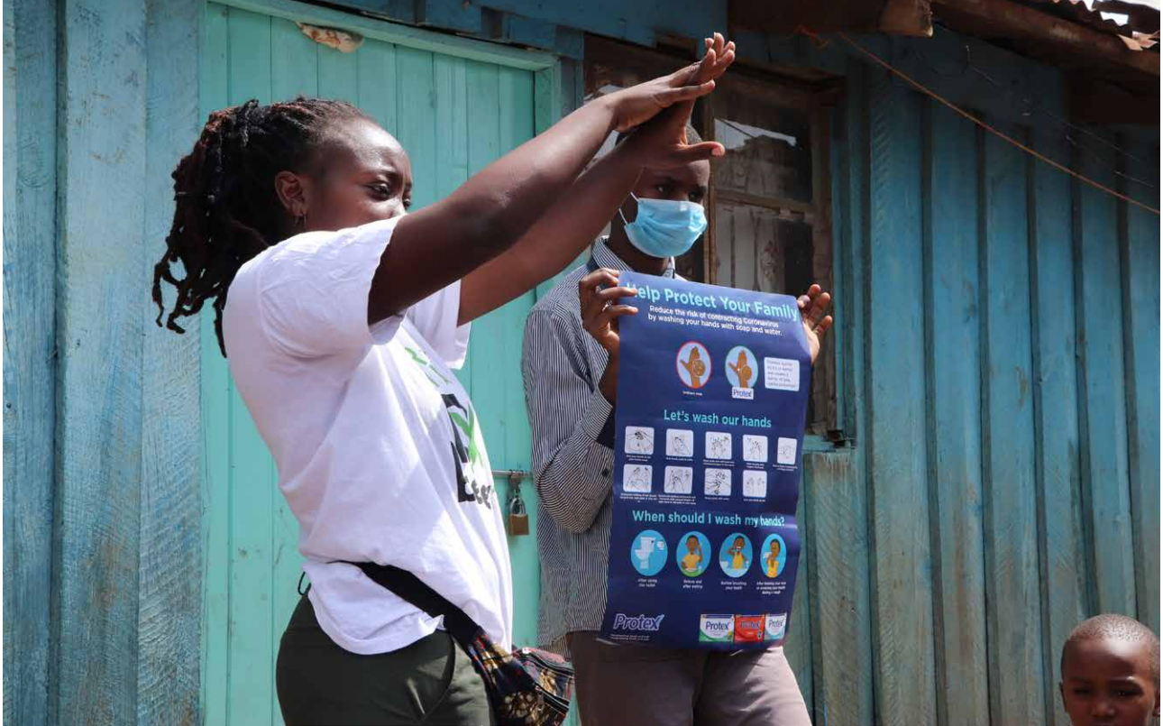
HANDWASHING PRACTICE AT SCHOOLS