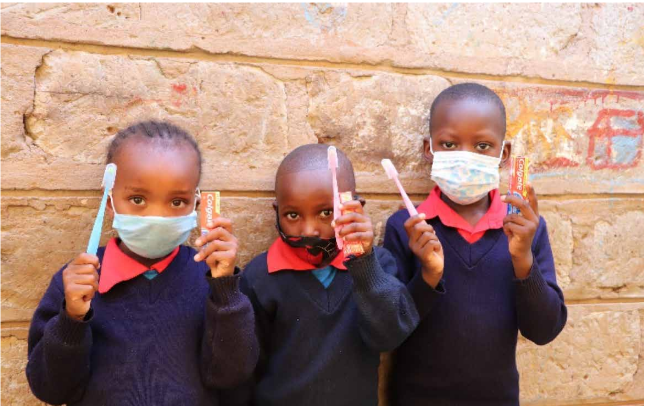
TOOTHBRUSH DEMO AT SCHOOLS