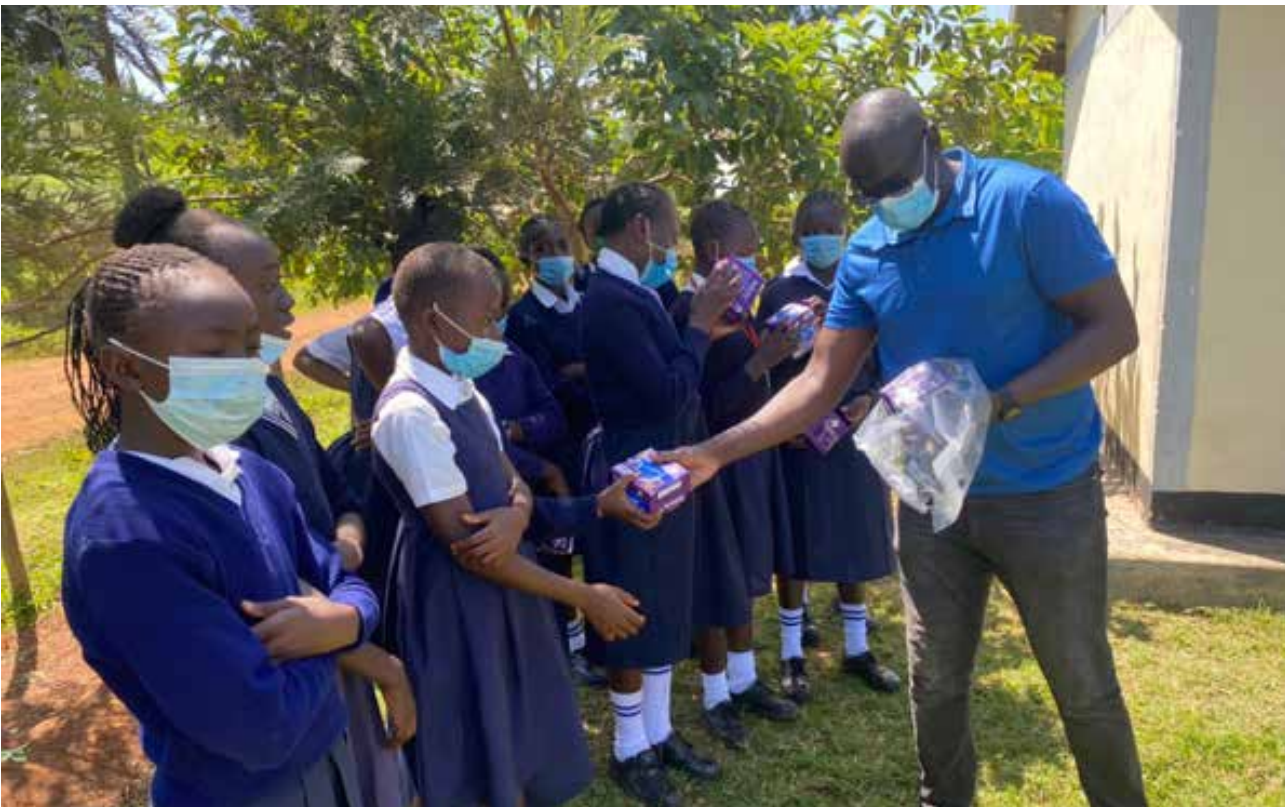
PATOH GIVING SCHOOL GIRLS SANITARY PADS